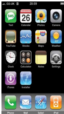
Step 1: Press settings

The setup process for both of these devices is identical, the screen shots below are from an iPhone.