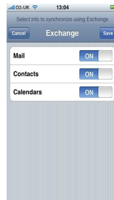
Step 6: Decide the data types you want to synchronise

E-mail = your full address Domain = leave this blank Username = your full e-mail address Password = your mailbox password Description = anything you like