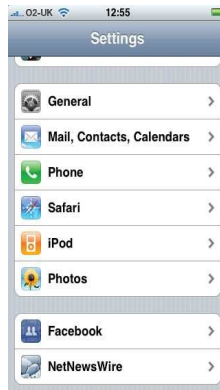
Step 2: Press Mail, Contacts, Calendars