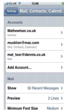
Step 3: Press Add Account